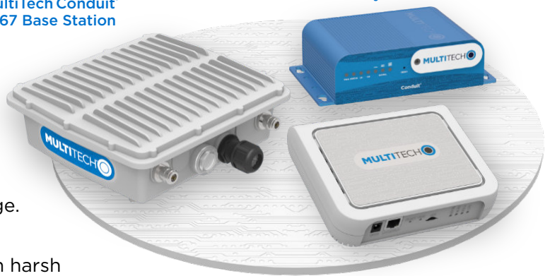
MultiTech Conduit® AP Access Point