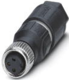
Sensor/actuator connector, female connector, straight, 3-pos., M8, QUICKON-ONE, metal knurl, maximum cable diameter of 5.0 mm

Please be informed that the data shown in this PDF Document is generated from our Online Catalog. Please find the complete data in the user's documentation. Our General Terms of Use for Downloads are valid ( http://download.phoenixcontact.com )