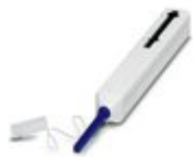
Ferrule cleaner, 1.25 mm, for LC, approx. 500 cleaning cycles

FO accessories - FOC-TOOL-FERRULECLEANER-1.25 - 1407032