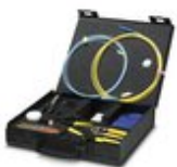
Tool set for GOF assembly

Tool set - FOC-TOOL-GOF KONF SET - 1411049