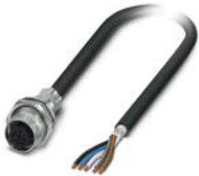
Flush-type socket, shielded, 5-pos., M12, A-coded, rear/screw mounting with M16 thread, with 2 m cable, 5 x 0.34 mm 2

Please be informed that the data shown in this PDF Document is generated from our Online Catalog. Please find the complete data in the user's documentation. Our General Terms of Use for Downloads are valid ( http://phoenixcontact.com/download )