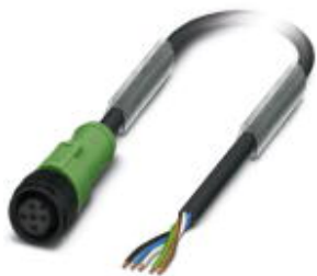
Sensor/actuator cable, 5-position, PUR halogen-free, black-gray RAL 7021, free cable end, on Socket straight M12, A-coded, cable length: 3 m, with plastic knurl

Please be informed that the data shown in this PDF Document is generated from our Online Catalog. Please find the complete data in the user's documentation. Our General Terms of Use for Downloads are valid ( http://phoenixcontact.com/download )