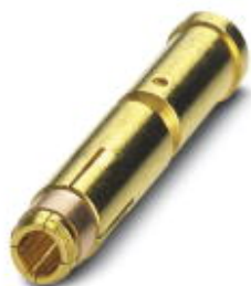
Crimp contact, turned, contact diameter: 2 mm, crimp range: 1.5 mm 2 ... 2.5 mm 2

Please be informed that the data shown in this PDF Document is generated from our Online Catalog. Please find the complete data in the user's documentation. Our General Terms of Use for Downloads are valid ( http://phoenixcontact.com/download )