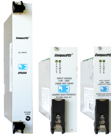
COMPACTPCI® SERIES FRONT VIEW