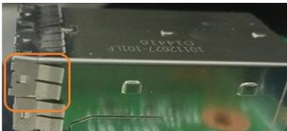
loosened EMI strap

Current latches are shaped by lancing and withstand strength is weak