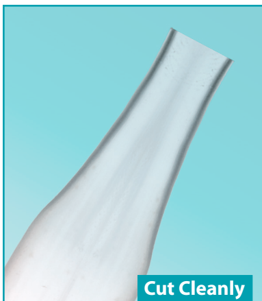
Cut Cleanly Scissor