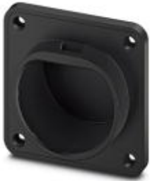
Retainer for Vehicle Connector as parking position at charging stations (EVSE), GB/T, GB/T 20234.2, Front mounting

Please be informed that the data shown in this PDF Document is generated from our Online Catalog. Please find the complete data in the user's documentation. Our General Terms of Use for Downloads are valid ( http://phoenixcontact.com/download )