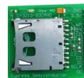
SD Card Adapter