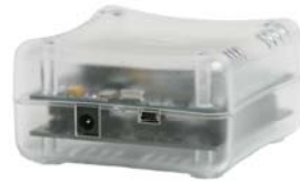
ICE-Cube (available in CY3215-DK)

For simple programming, a MiniProg is included in the CY3210-SDCARD kit. For full emulation you can attach an ICE-Cube to the PsoCEval1 board. (The ICE-Cube is available in the CY3215-DK.)