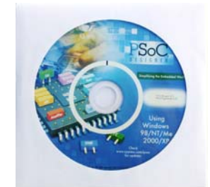
PSoC Designer CD-ROM