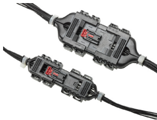
MultiCat Mid-Power Connector System