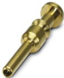
Crimp contact, turned, contact diameter: 3.6 mm, crimp range: 2.5 mm 2 ... 4 mm 2

Please be informed that the data shown in this PDF Document is generated from our Online Catalog. Please find the complete data in the user's documentation. Our General Terms of Use for Downloads are valid ( http://phoenixcontact.com/download )