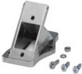
45° adapter for panel mounting frames

Please be informed that the data shown in this PDF Document is generated from our Online Catalog. Please find the complete data in the user's documentation. Our General Terms of Use for Downloads are valid ( http://phoenixcontact.com/download )