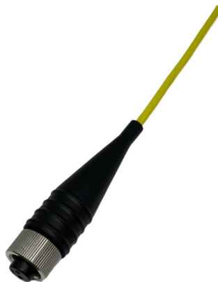
CMCP602H 2 Socket Locking Collar