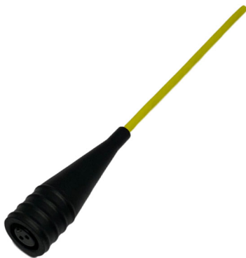
CMCP602HST Push On IP68 Connector