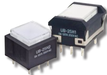
UB Series with Super Bright White LED

The Super Bright White LEDs for UB Series pushbutton switches and indicators will be changing. Both standard and custom pushbuttons and indicators are included in the revision. The change will effect electrical specifications, which are compared below with the new specifications. Part numbers for effected standard switches and indicators are shown on the following page.