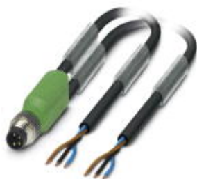
Sensor/actuator cable, 3-position, PUR halogen-free, black-gray RAL 7021, Plug straight M8, on free cable end and free cable end, cable length: 5 m

Please be informed that the data shown in this PDF Document is generated from our Online Catalog. Please find the complete data in the user's documentation. Our General Terms of Use for Downloads are valid ( http://phoenixcontact.com/download )