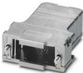
D-SUB sleeve housings, degree of protection: IP20, material: ABS, metal-plated, cable outlet: angled, size of housing: 2, color: Bare metallic

Please be informed that the data shown in this PDF Document is generated from our Online Catalog. Please find the complete data in the user's documentation. Our General Terms of Use for Downloads are valid ( http://phoenixcontact.com/download )