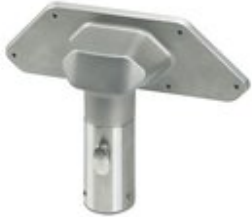
Boom adapter for FPM/PPC 17.3 and 23.8 AIO69k

Please be informed that the data shown in this PDF Document is generated from our Online Catalog. Please find the complete data in the user's documentation. Our General Terms of Use for Downloads are valid ( http://phoenixcontact.com/download )