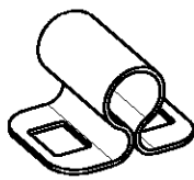
Foil Clip Folienklammer