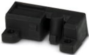
Holder for marking element

Please be informed that the data shown in this PDF Document is generated from our Online Catalog. Please find the complete data in the user's documentation. Our General Terms of Use for Downloads are valid ( http://phoenixcontact.com/download )