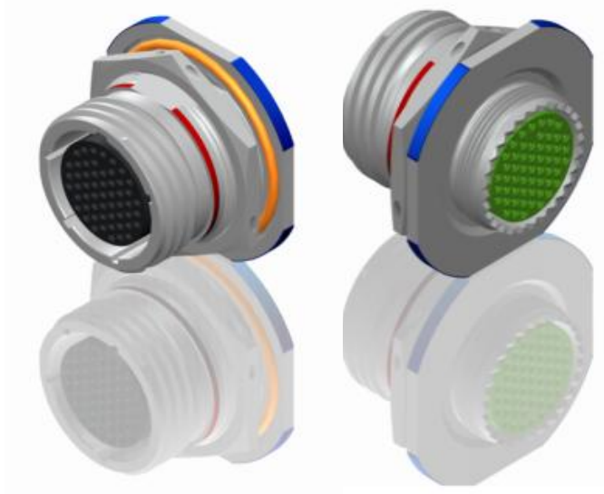
LAYOUT SHOWN AS EXAMPLE