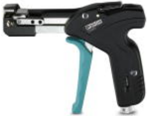
Cable binder pliers, for steel cable binders with a width of up to 7.9 mm, for a material thickness of up to 0.3 mm

Please be informed that the data shown in this PDF Document is generated from our Online Catalog. Please find the complete data in the user's documentation. Our General Terms of Use for Downloads are valid ( http://phoenixcontact.com/download )