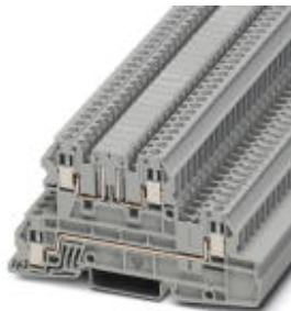
Installation level terminal block, Screw connection, cross section: 0.2 mm 2 - 4 mm 2 , AWG: 24 - 12, width: 5.2 mm, color: gray, mounting type: NS 35/7,5, NS 35/15

Please be informed that the data shown in this PDF Document is generated from our Online Catalog. Please find the complete data in the user's documentation. Our General Terms of Use for Downloads are valid ( http://phoenixcontact.com/download )