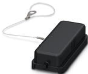
Protective cover D25, for single locking latch, protective cover material: PA, height: 19 mm

Please be informed that the data shown in this PDF Document is generated from our Online Catalog. Please find the complete data in the user's documentation. Our General Terms of Use for Downloads are valid ( http://phoenixcontact.com/download )