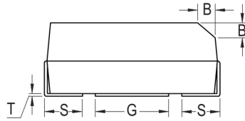
ANODE (+) END VIEW