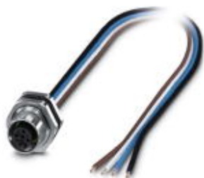
Flush-type connector, Universal, 5-position, Socket, M12, A-coded, Rear mounting, M16 x 1.5, Individual wires, cable length: 0.5 m

Please be informed that the data shown in this PDF Document is generated from our Online Catalog. Please find the complete data in the user's documentation. Our General Terms of Use for Downloads are valid ( http://phoenixcontact.com/download )