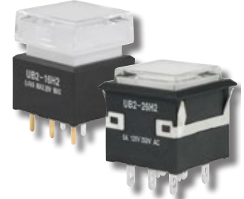
UB2 Series with Super Bright Blue LED Will Have Changes

The Super Bright Blue LEDs for UB2 Series pushbutton switches and indicators will be changing. Both standard and custom pushbuttons and indicators are included in the revision. The change will effect electrical specifications, which are compared below. It will also effect the LED terminal dimensions and terminal plating, displayed on page 2. Part numbers for effected standard switches and indicators are shown on page 3.