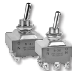
Changes for S30 & S40 Toggles

CN-0319 was originally released December 2017. Since that time, NKK Switches has decided that Change 2 (page 2) will not be implemented, effective May 2018 (CN-0319-A). There are no modifications to Changes 1 and 3, which will be administered as indicated.