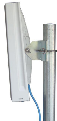
EZ-Bridge-LT™ tool-less installation