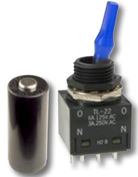
Changes for TL & DS Series

Effected standard part numbers for TL Series and DS Series are displayed on page 2.