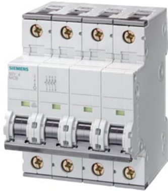
Miniature circuit breaker 400 V 10kA, 4-pole, C, 8A, D=70 mm