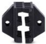
Spare die, for CRIMPFOX 50R

Replacement die - CRIMPFOX 50R/DIE - 1212042