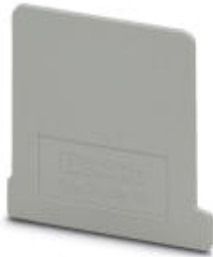
End cover, Length: 42.5 mm, Width: 1.3 mm, Color: gray

Please be informed that the data shown in this PDF Document is generated from our Online Catalog. Please find the complete data in the user's documentation. Our General Terms of Use for Downloads are valid ( http://download.phoenixcontact.com )