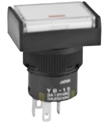
YB Series Spot Illuminated with 24V Amber LED and Resistor

Standard and custom YB pushbuttons with 24-volt amber LEDs and resistor are included in the change, and part numbers for effected standard assemblies are shown on the table below at right. The assembly consists of spot illuminated cap, built-in 24V amber LED and resistor.