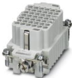
HEAVYCON female insert, DD42 series, 42-pos., crimp connection

Please be informed that the data shown in this PDF Document is generated from our Online Catalog. Please find the complete data in the user's documentation. Our General Terms of Use for Downloads are valid ( http://phoenixcontact.com/download )