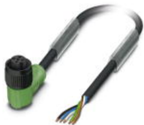
Sensor/actuator cable, 5-position, PUR halogen-free, black-gray RAL 7021, free cable end, on Socket angled M12, A-coded, cable length: 1.5 m, with plastic knurl

Please be informed that the data shown in this PDF Document is generated from our Online Catalog. Please find the complete data in the user's documentation. Our General Terms of Use for Downloads are valid ( http://phoenixcontact.com/download )