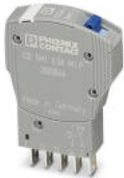
Thermomagnetic device circuit breaker, 1-pos., tripping characteristic M1 (medium-blow), 1 PDT contact, plug for base element.

Please be informed that the data shown in this PDF Document is generated from our Online Catalog. Please find the complete data in the user's documentation. Our General Terms of Use for Downloads are valid ( http://download.phoenixcontact.com )