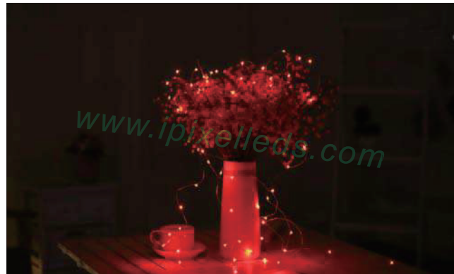
photo frame/decorative plant