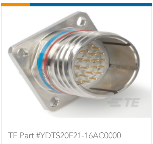
SQUARE FLANGE RECEPTACLE