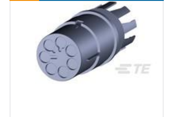
TE Part #293722-1 NECTOR M PIN HSG FREE HANGING 7P CODE A