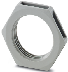
Color-coding, Range of articles: PRC 35, Nut, color: gray

Please be informed that the data shown in this PDF Document is generated from our Online Catalog. Please find the complete data in the user's documentation. Our General Terms of Use for Downloads are valid ( http://phoenixcontact.com/download )