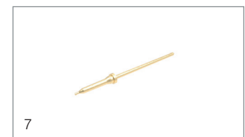
(1) Probe, (2) Grabber Hook, (3) BNC Adapter, (4) Alligator Ground lead, (5) RF Ground Spring, (6) Adjustment Tool, (7) Replacement Tips