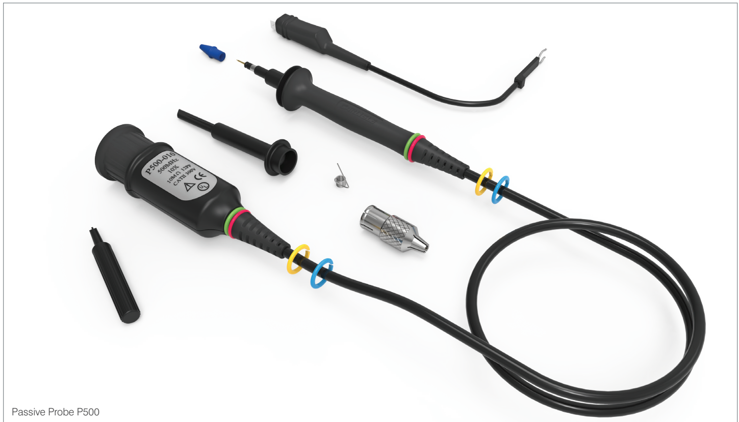
Passive Probe P500