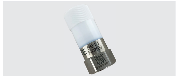
FIGURE 1. 8911 WIRELESS ACCELEROMETER FROM TE CONNECTIVITY