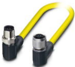
Sensor/actuator cable, 8-position, PVC, yellow, shielded, Plug angled M12 SPEEDCON, A-coded, on Socket angled M12 SPEEDCON, A-coded, cable length: 0.5 m

Please be informed that the data shown in this PDF Document is generated from our Online Catalog. Please find the complete data in the user's documentation. Our General Terms of Use for Downloads are valid ( http://phoenixcontact.com/download )