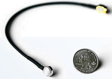
Compact ultrasonic sensor BHU100

BHU series ultrasonic sensors are built for structural health monitoring. They are based on piezoelectric and can be paired with ultrasonic scanner and receiver for structural integrity inspection. They are compact and protected with metal shells for long lasting life. They can be mounted on structure permanently with epoxy. BHU series ultrasonic sensors can be used with BroadScan ultrasonic scanner for structural health monitoring of metal or composite structures.