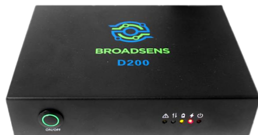
Ultrasonic scanner D200