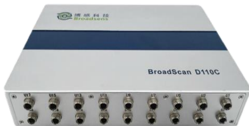
Ultrasonic scanner D110C