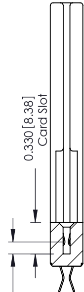
0.125 [3.18] Point of Contact SECTION A-A

See Accompanying Page for: • Mounting Options