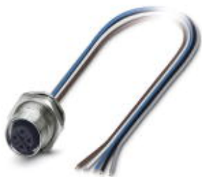
Sensor/actuator flush-type socket, 5-pos., M12, A-coded, rear/screw mounting with Pg9 thread, with 0.5 m TPE litz wire, 5 x 0.5 mm 2

Please be informed that the data shown in this PDF Document is generated from our Online Catalog. Please find the complete data in the user's documentation. Our General Terms of Use for Downloads are valid ( http://phoenixcontact.com/download )