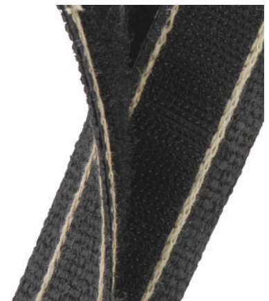
Strong Para Aramid stitching provides long lasting support for the hook and loop.