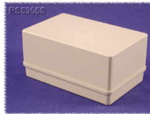
Assembled View (Bottom)