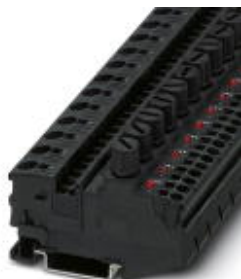
Fuse terminal block for cartridge fuse insert, cross section: 0.5-10 mm 2 , AWG: 20-8, width: 12.2 mm, color: Black

Please be informed that the data shown in this PDF Document is generated from our Online Catalog. Please find the complete data in the user's documentation. Our General Terms of Use for Downloads are valid ( http://phoenixcontact.com/download )